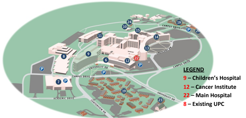
IMAGE 1 PSU HMC Campus Map

The site for the new Children's Hospital is surrounded by 2 major buildings. Just north of the Children's Hospital lays the existing Cancer Institute Building that directly joins with the new Children's Hospital. On the west side the Children's Hospital joins with the existing Main Hospital Building. The new Children's Hospital